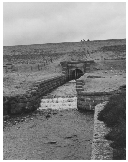
Fig 7: Masonry step overflow weir

In order to maintain the flow of the Bar Brook during the excavation work a 'V' notch was cut to one side of the draw off tunnel and the stream allowed to flow through the tunnel. This was sealed upon completion.