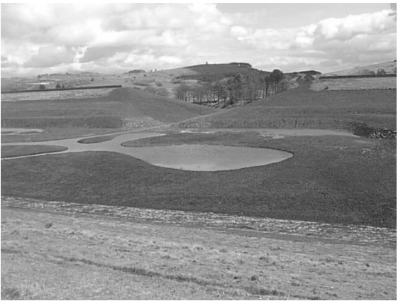
Fig. 14: View of the reservoir from the west showing the 'V' notch, pools and embankments formed in the reservoir basin.