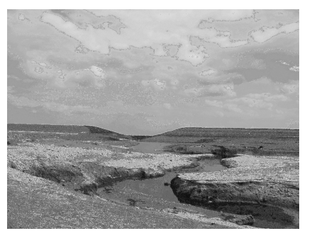
Fig. 8 Course of stream allowed to follow natural course

The course of the brook was allowed to form naturally through the reservoir basin (Fig 8). From historical records the brook appeared to return to a similar course to that which existed before the dam was built.