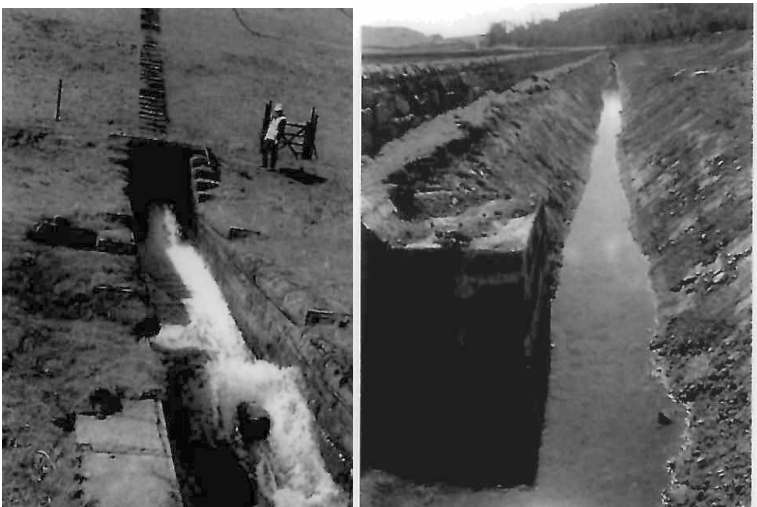
Fig. 12: Spill channel

All the excavated material and masonry lining resulting from the formation of the notch was retained on site to line the bottom of the reservoir, pools and scrapes for habitat creation and embankments within the reservoir basin. The masonry lining removed from the area of the 'V' notch was used to line the new channel and the surplus buried under the mounding formed from the excavated material. It was not considered economic to sell the surplus stone.