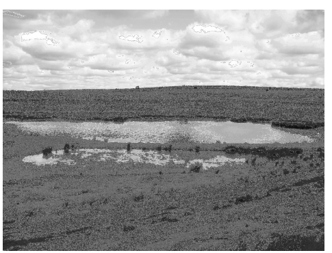
Fig. 10: Pools created in reservoir basin

There was a flexible approach to the work on site. The stone weir shown below was discovered buried in the silt after work started. It was decided to utilize it as part of the reinstated water course and to form a pool near the head of the reservoir.