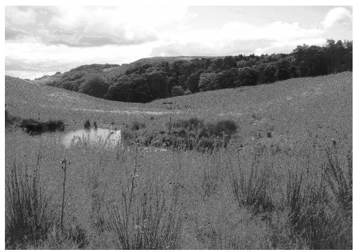
Fig. 5: View from position of top reservoir looking south

The scope of the project was to drain down the existing reservoirs, break out the concrete and brick liners, demolish the water tower and valve chambers, cut a V-notch in the lower dam wall, and using the arisings from the dams to re-profile the sides of the reservoir to form a natural valley shape, with a stream at the base feeding 4 pools, which were created to encourage wildlife and aquatic vegetation. (Fig.5) All the materials arising from the earthworks including the concrete and brick were buried on site.