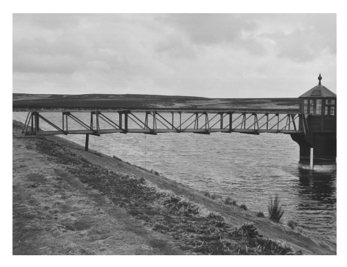
Fig. 6: Valve tower and Bridge

Silt traps installed downstream. Reservoir drained over a period of 4 weeks. Water monitored for sediment content.