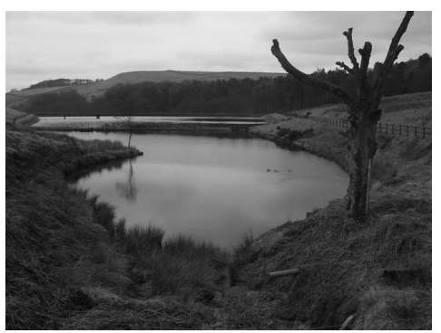
Fig. 2: Upper reservoir looking in a southerly direction

The Reservoirs were fed by Hogshaw Brook via a penstock into the top (small) reservoir. A bywash channel existed to the Western side of the reservoir to take excess flow when the reservoir was full. The construction of the reservoirs was concrete lined with brick facing on the lower basin & stone facing on the older upper reservoir. (Fig. 2)