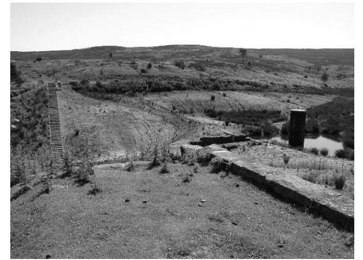
Fig 1: Disused Westworth Reservoir

The cost of the works was of the order of £100k.