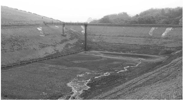
Fig. 4: Lower Reservoir Construction

The local residents in the roads leading up to the site were worried about the loss of habitat from the complete disappearance of the water bodies, but also were aware that if the reservoirs were removed, the anti-social behaviour would be greatly reduced, if not cease altogether. They therefore supported the discontinuance, but requested that some water remained for the birds and other form of wildlife which inhabited the reservoirs.