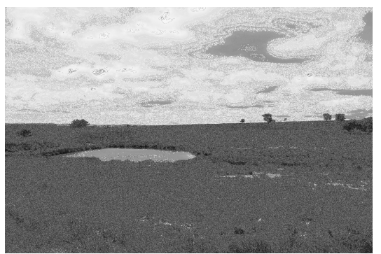
Fig. 11: Pools created in reservoir basin

A single contract was let for the discontinuance of both Barbrook and Ramsley reservoirs. The project aims at Ramsley were similar to those at Barbrook but on a smaller scale. (Fig. 11). It also did not have the problem of having a sizeable water course running through the basin.