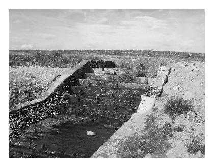
Fig. 9: Stone weir discovered buried